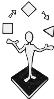
prototype toward a solution