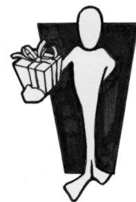
show don't tell