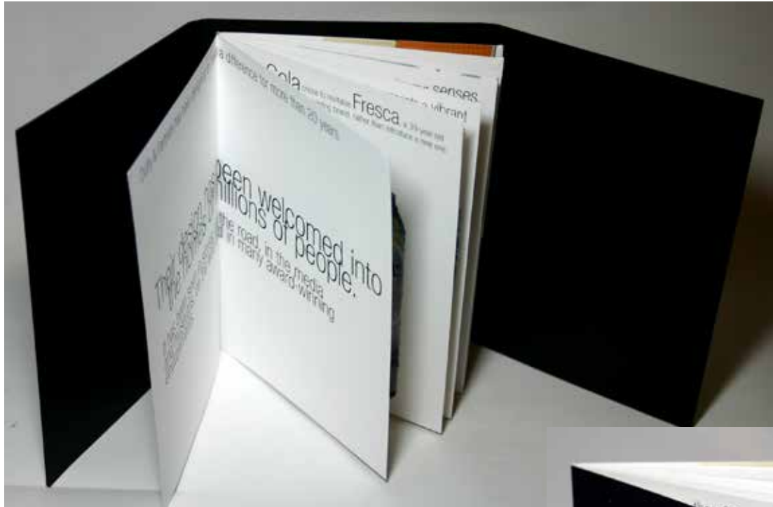
Duffy and Partners -