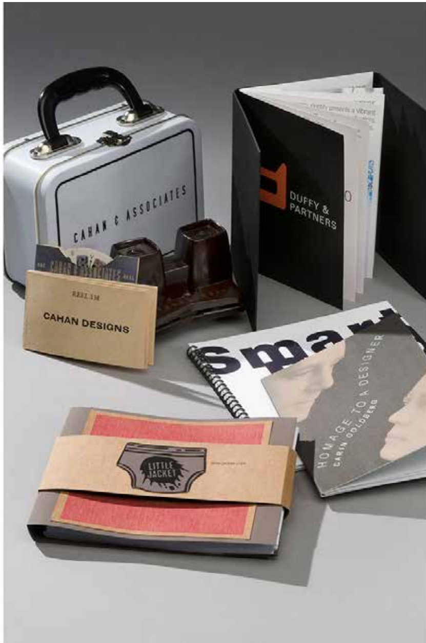
The first year - books.